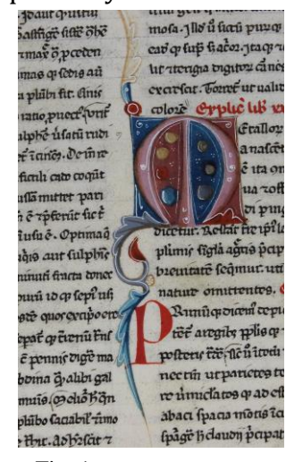
Fig. 1 Madrid. Biblioteca Real de el Escorial, Ms. R.I.5. Pliny the Elder, Natural History . Initial "M."

Pliny, a Bolognese manuscript dating to 1300, also illustrates Book xxxv, it does so in a different manner than Fra Pietro's, and instead features an abstracted design in brilliant gold, red and blue. [Fig. 1] The illuminator's self-portrait is part of a group of images from the Ambrosiana text that show activities associated with the subjects discussed as opposed to images of plants or animals (98). Armstrong describes these details as numbering amongst the most powerful compositions in the manuscript, and argues that they are probably Pietro's innovations instead of elements that he copied from an earlier model