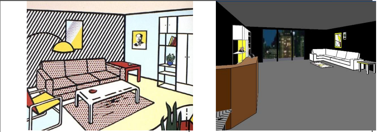
Fig. 3. Modern Room (1991) and the Façade lounge: evidence of remixed visual and spatial content (colouring, design, layout).

Finally, Façade by Andrew Stern and Michael Mateas is a stand-alone computer program that presents as a three-dimensional interactive drama set in the apartment of Grace and Trip, a thirty-something middle-class couple who have problems in their marriage. The reader plays an old friend from college who is invited around for drinks. The evening "quickly turns ugly, [as] you become entangled in the high-conflict dissolution of Grace and Trip's marriage. No one is safe as the accusations fly, sides are taken and irreversible decisions are forced to be made" ( Façade Web). For remixed