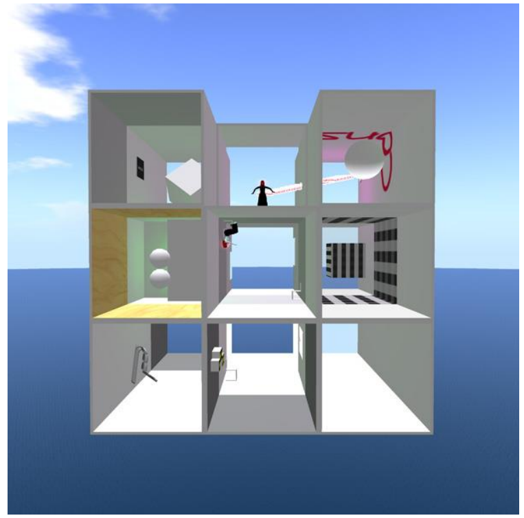
Fig. 2. Salevy Oh, CONSTRUCT (2011)

possibilities of the work as a stage in an interactive remix and not back to a single original authoritative creator.